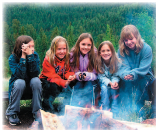
Grade 4 & 5 campers enjoy sitting around the fire during campout

Trail Call is published each winter by Rocky Mountain Mennonite Camp.