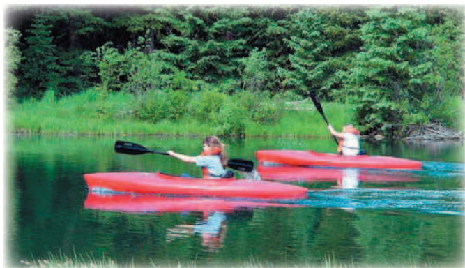
Family Camp participants crossing the pond