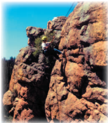
Rappelling down Monkey Rock

For 2005, a new custom trip has been added to the Wilderness Program. It is offered to youth groups, family groups or friends of any age on July 10-16. Let us take your group (typically 7-10 people) on a Wilderness experience in the Colorado high country!