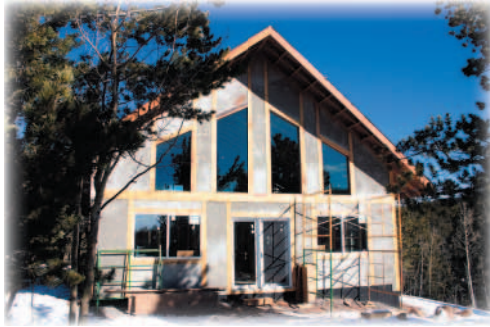
Eagles Nest stands ready for interior work

What a difference seven months can make. The new Eagles Nest is now enclosed and ready for the interior finishing touches. Time is of the essence as the first guest group arrives next June!