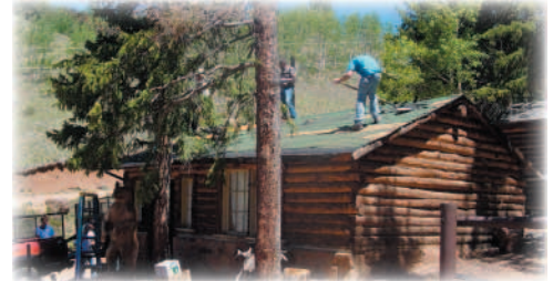
Work on the Nature Center roof