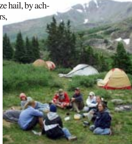
Wilderness campers on backpacking trip

ing muscles and enormous blisters, and by outdoor culinary failures like "oreo pudding" and "spaghetti soup." I have been inspired by trees growing from boulders, by fields of waisthigh wildflowers, and by looking down upon a rainbow. These are the things I am going to miss, and these are the things that will continue to call me back.