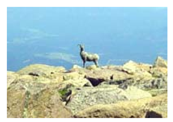
The hike to Pikes Peak this summer included bighorn sheep sightings