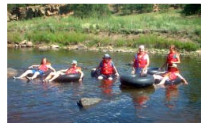
Family campers enjoy a sunny day of tubing on the South Platte River