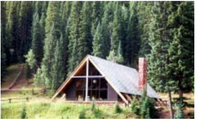
The Chapel with its original wood shingles needs a new roof that is fire resistant and attractive

Throughout the strategic planning, the program and ministry of Camp was the purpose behind facility improvements. For example, the renovation of the Eiger Bathhouse is to upgrade and balance the number of facilities (showers, sinks, toilets) in both the male and female restrooms. This need is a reflection of the success of Family Camps which serve an equal number of males on what is typically the "girls" side during youth camps.