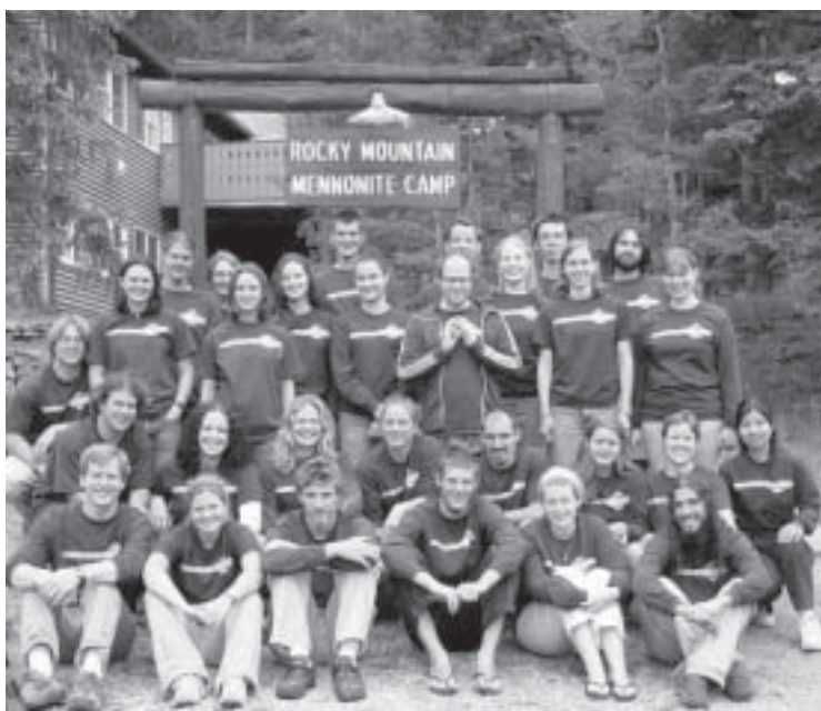
The summer staff of 2002

The 50th Anniversary Celebration helped put these challenges into perspective. What an amazing achievement for God’s ministry here at Rocky Mountain and the impact it has had on so many lives. It is a tribute to all of the people with vision, faith and perseverance (overcoming their own challenges) who led this place to what it is today. Many special people carried on that legacy this summer.