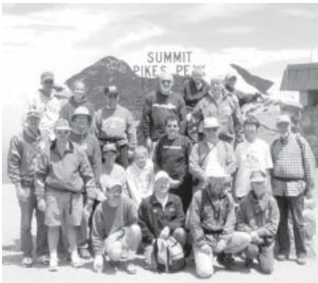
Family Camp I Pikes Peak climbers at the top!