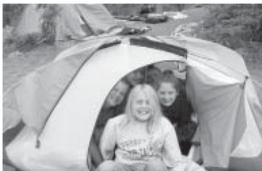
Overnight campout during resident camp

When looking at facilities, securing more water rights was a top priority along with the renovation of Eagles Nest, Chalet Emmental, Eiger Bathhouse, and other facilities. No new construction is part of the strategic plan, unlike the Vision 2002 campaign. The goal is to simply improve existing facilities to better serve the needs of guests and program events.