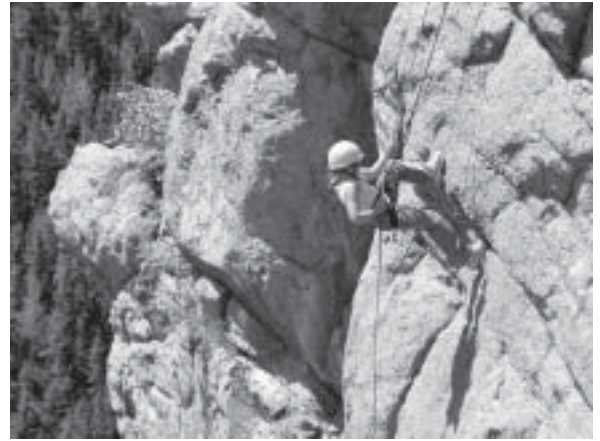
Rappelling on Monkey Rock

Trail Call is published each winter by Rocky Mountain Mennonite Camp.