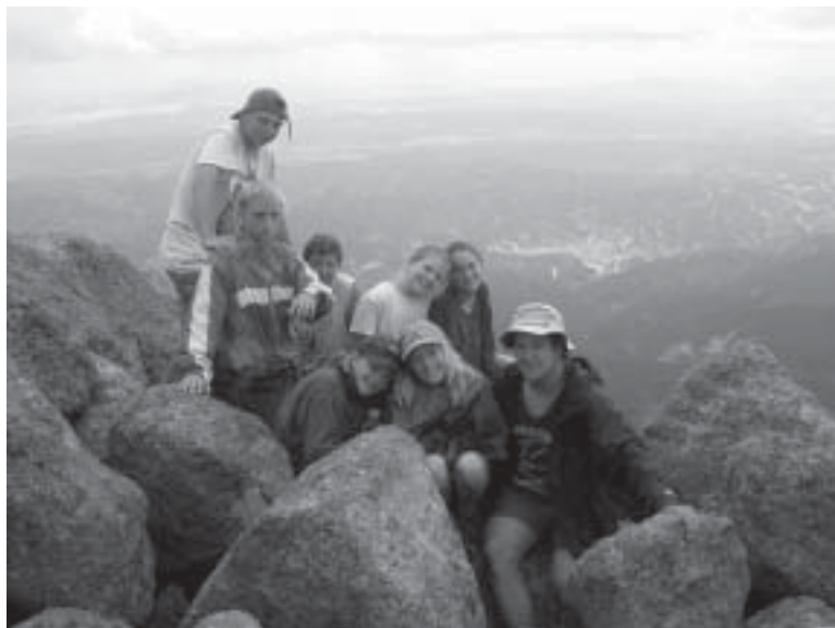
Wilderness campers enjoy the view