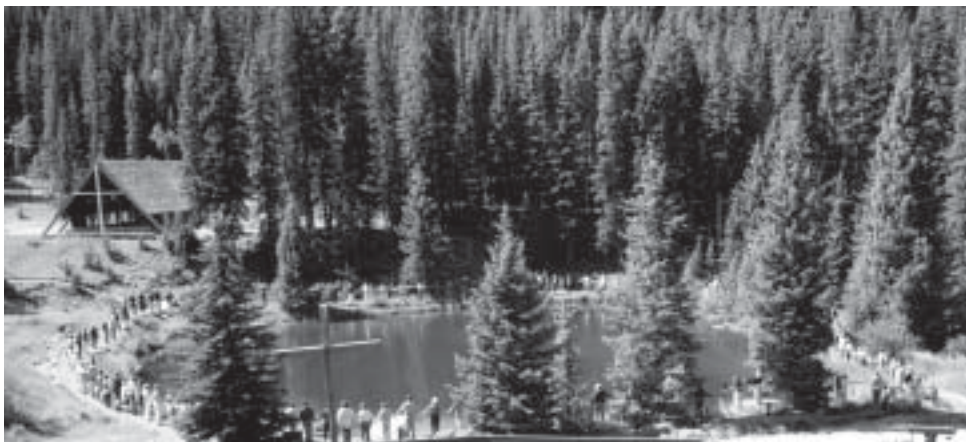
Sunday morning worship with participants encircling the pond

Rocky Mountain Mennonite Camp celebrated 50 years of Christian camping this summer. In 1952 the location south of Divide, CO hosted youth camps for the first time. Summer youth camps had previously been hosted by Rocky Mountain area Mennonite Churches in state parks or rented facilities. The purchase of several mining claims in 1951 gave RMMCamp a setting that has been enjoyed for 50 years.