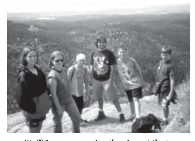
Staff & campers enjoy the view at the top