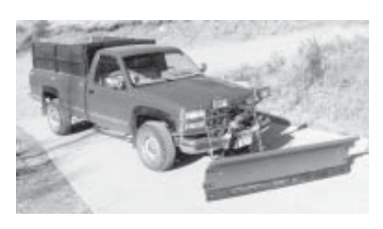
Rocky Mountain purchased a much needed pickup (seen above) along with a Suburban from generous year-end donations last winter.