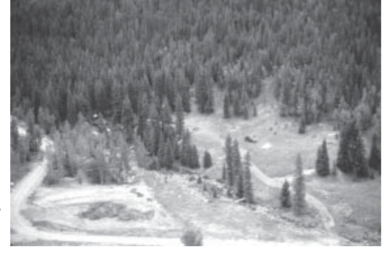
The ballfield and Four-Mile creek as they appeared in 1952