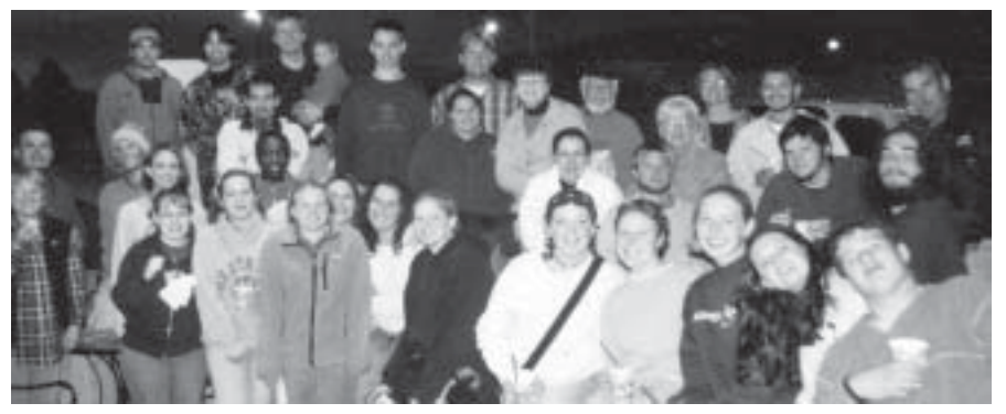
The summer staff enjoy an evening with ice cream as part of staff orientation week