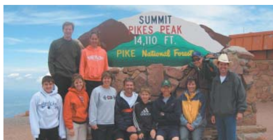
Family Camp I participants record their accomplishment of climbing Pikes Peak (approximately 1 mile up and 4 miles across) with a photo at the top