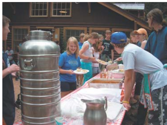
The tradition of serving chicken BBQ continues on and the aroma along with the bell reminds everyone that it's time to eat!

-Jenelle (Musselman) Roynon (Summer Program Dir.)