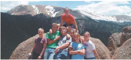
Sr. High Resident campers with a great view on top of Old Baldy