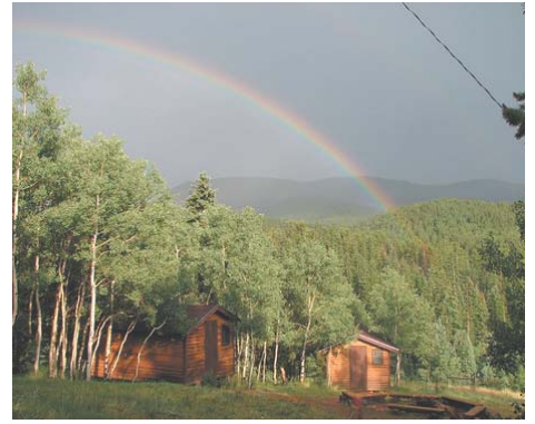
Wilderness Campers at Park Ridge enjoyed a rainbow last summer

Grade 6&7 Resident Campers created this inspirational welcome on the door mat of their cabin to welcome the mystery housekeeper who inspects the cabin while they are away