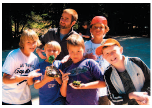
Grade 4&5 Resident campers proudly displaying their watercraft (made of all natural materials) before the annual boat race!