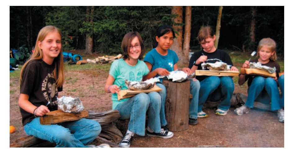
What campout would be complete without a "hobo" dinner as these Grade 6 & 7 campers get ready to enjoy their meal around the campfire.

Emmanuel Mennonite Retreat Peace Community Mennonite Retreat Labor Day Work & Play Retreat Glennon Heights Mennonite Retreat Beth-El Mennonite Retreat First Mennonite Denver Retreat Greeley Mennonite Retreat Mountain Community Mennonite Retreat Fall Quilter's Retreat