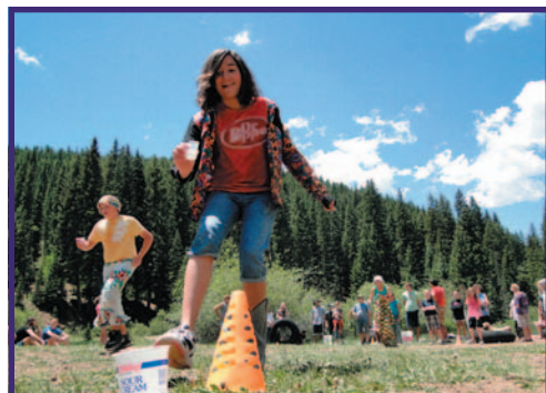
During MennOlympics, resident campers race to help their team during the relay.

Trail Call is published each winter by Rocky Mountain Mennonite Camp.