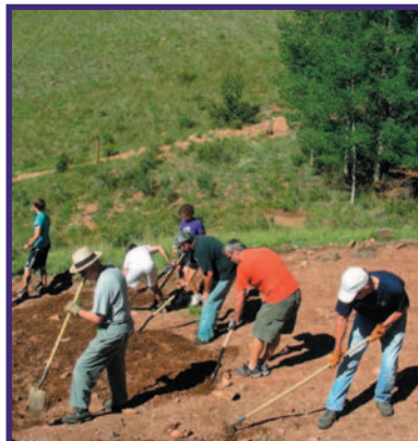
Sowers of the seed volunteers and staff worked together to reclaim the disturbed ground above and below Emmental Retreat Center. Shovels, rakes, mulch, seed and determination were the key ingredients in covering the dug up ground from the installation of the surprise septic system.