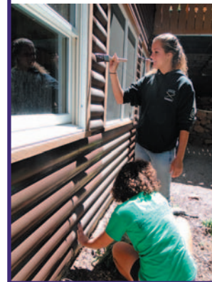
Volunteer help is a vital part of caring for guests and facilities.