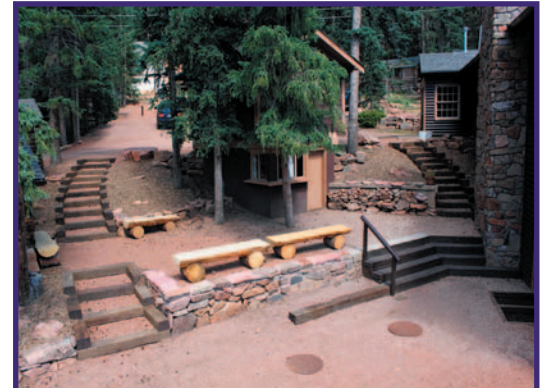
The area around Trading Post received new stairs and seating for campers and guests to enjoy. The lids to the new grease traps are seen at bottom in the path.