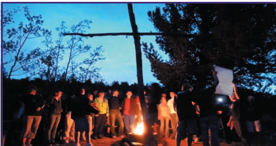
Campers sing songs to our Creator around a campfire at Inspiration Point.