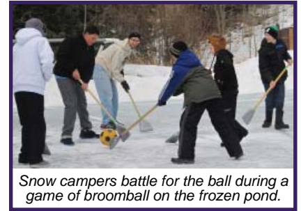
Snow campers battle for the ball during a game of broomball on the frozen pond.