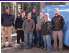
Greeley Mennonite Church volunteers winterized the campground by stacking picnic tables under the tarp.